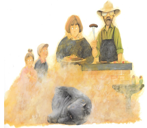
The Dust Bath

Look at this picture. It's called 'The Dust Bath'. Write a sentence expressing what the wombat thinks about having a dust bath.